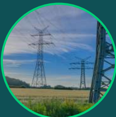
EIRGRID REPRESENTATIVE EirGrid