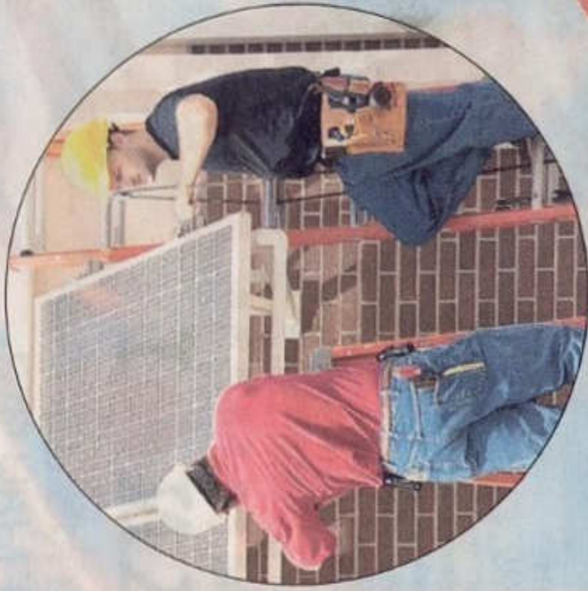
THE SMART CHOICE: Workers fit solar panels to an eco-friendly house

With the downturn in the property market increasing, homeowners are looking at how they can make their castles more cosy, without the hassle involved in finding