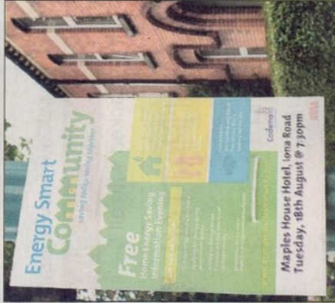
UNIQUE: The initiative has been a huge success so far

SICK of shivering your way through a draughty house every winter? Is your lagging jacket well past its sell-by date? Are you tired of forking out for huge home-heating bills?